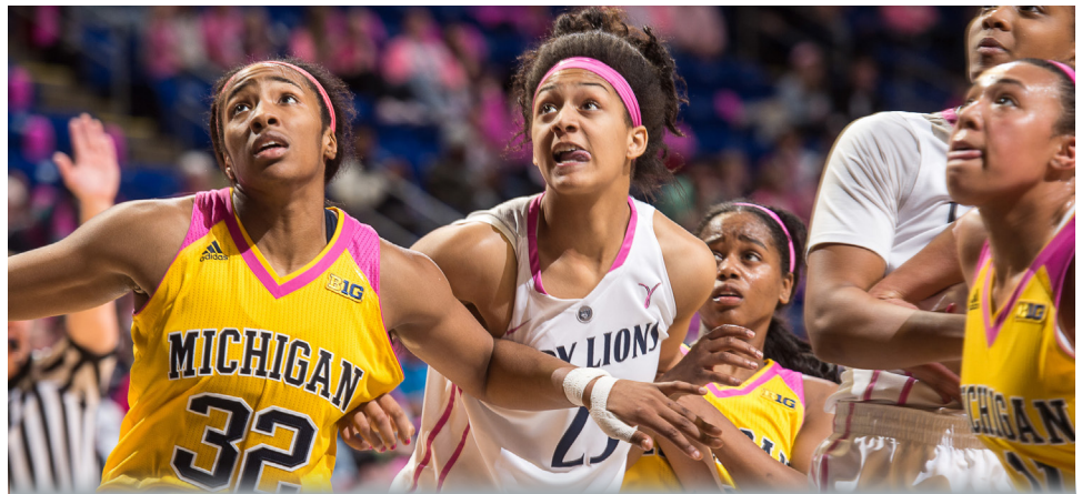
TWO GAME ROAD SWING BEGINS AT IOWA ON WEDNESDAY NIGHT