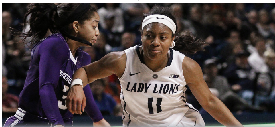
PENN STATE HEADS TO WELSH-RYAN ARENA FOR TUSSLE WITH NORTHWESTERN