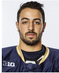
Park Ridge, Illinois Youngstown (USHL)