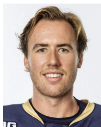
Boxborough, Massachusetts Cedar Rapids (USHL)