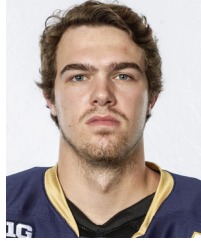
Edina, Minnesota Edina High School