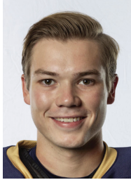
Eden Prairie, Minnesota Penticton (BCHL)