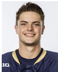
Rogers, Minnesota Sioux City (USHL)