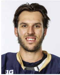
Halifax, Nova Scotia Dubuque (USHL)