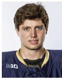
Eden Prairie, Minnesota Dubuque (USHL)