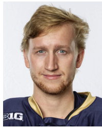
Stockholm, Sweden AIK J20 (SuperElit)