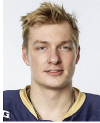
Brewster, New York Cedar Rapids (USHL)