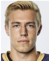
Mequon, Wisconsin USNTDP