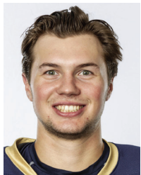
Parkland, Florida Green Bay (USHL)