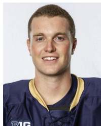
Boulder, Colorado Sioux City (USHL)