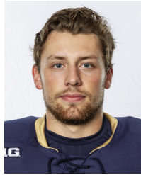
Northville, Michigan USNTDP