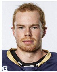
Boxborough, Massachusetts Sioux Falls (USHL)