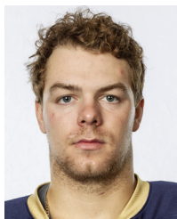
Lake Bluff, Illinois Fargo (USHL)