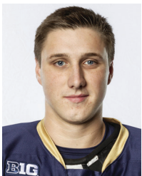
Bedford, New Hampshire Dubuque (USHL)