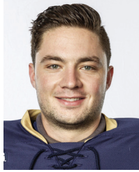
Larkspur, Colorado Waterloo (USHL)