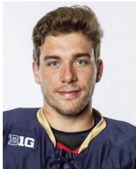
Naperville, Illinois USNTDP