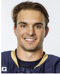
Waukesha, Wisconsin New Jersey (USPHL)