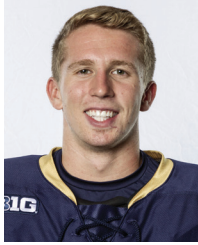
Winnetka, Illinois Central Illinois (USHL)