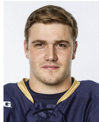
Bedford, New Hampshire Muskegon (USHL)