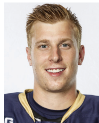
Monroe, Michigan Dubuque (USHL)