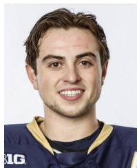
Rosemont, Illinois Tri-City (USHL)