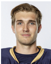
South Bend, Indiana Cedar Rapids (USHL)