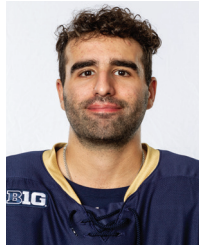
Crystal Lake, Illinois Tri-City (USHL)