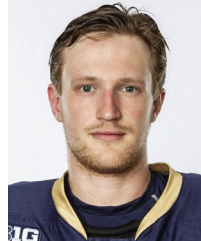
Aurora, Ontario Youngstown (USHL)