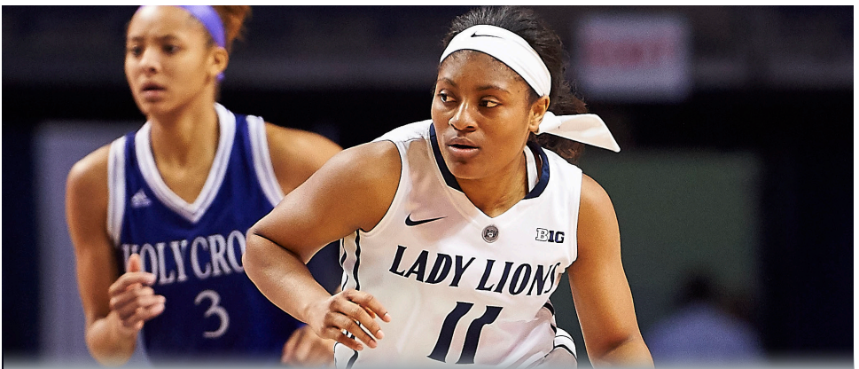
PENN STATE CLOSES STAY ON WEST COAST WITH FIRST MEETING VS. BYU