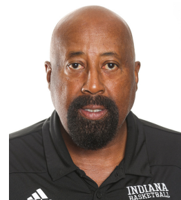
MIKE WOODSON Head Coach Second Year at IU 31-19