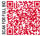
SCAN FOR FULL BIO