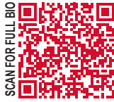
SCAN FOR FULL BIO