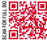
SCAN FOR FULL BIO

FORWARD • 6-7 • 210 • GR. • TORONTO, ONTARIO (JOHN POLANYI COLLEGIATE INSTITUTE/WESTERN MICHIGAN/ST. FRANCIS (N.Y.)) @ PATRICK_EMI / PATRICK_EMI