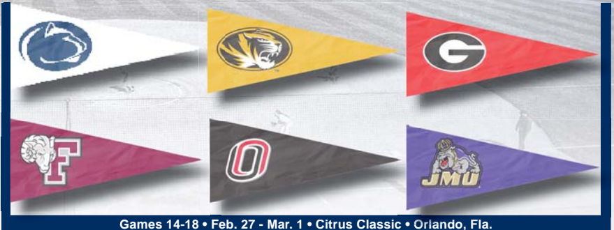
Games 14-18 • Feb. 27 - Mar. 1 • Citrus Classic • Orlando, Fla.

* Big Ten contest | ~ B1G Tournament, Columbus, Ohio Home games in BOLD CAPS at Nittany Lion Softball Park & Beard Field