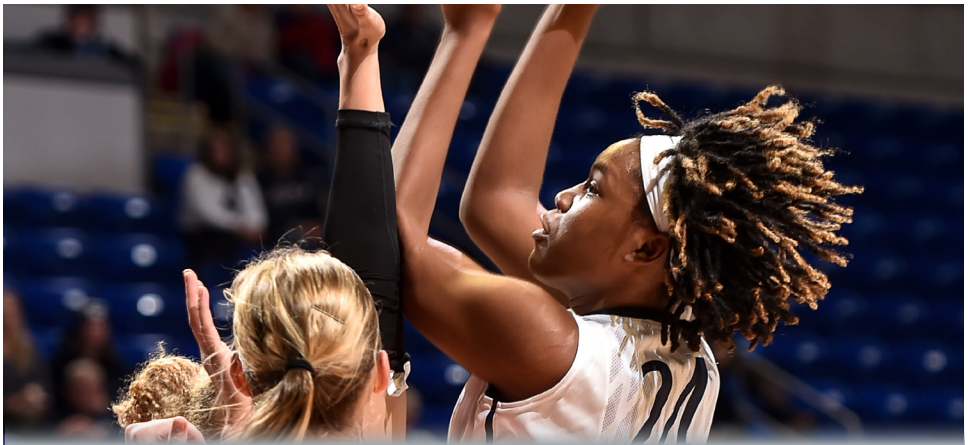
LADY LIONS RETURN HOME TO FACE YOUNGSTOWN STATE