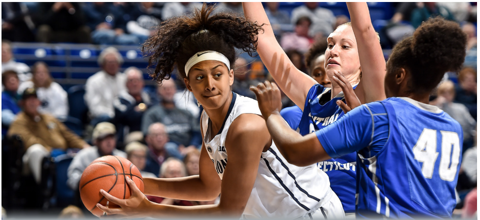
SACRED HEART SERVES AS FINAL NON-CONFERENCE TUNEUP FOR LADY LIONS