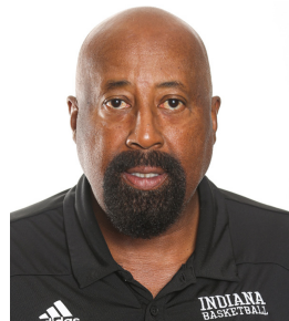
MIKE WOODSON Head Coach Second Year at IU 43-24