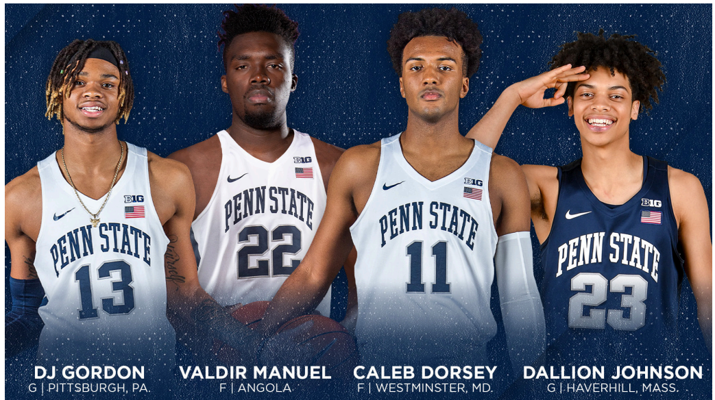
DJ GORDON G | PITTSBURGH, PA.

Full press release is available here: gopsusports.com/mbbclassof2020 .