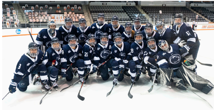
The 2020-21 Nittany Lions pose after their regular-season championship clinching win, 5-0, at RIT Friday, Feb. 19, 2021.

2019-20 Overall Record .....13-15-8 2019-20 CHA Record .....7-8-5 Postseason Finish..... CHA Semifinals Letterwinners Returning/Lost .....15/9 Newcomers.....9 Twitter.....@PennStateWHKY Instagram .....@PennStateWHKY Facebook..... PennStateWomensHockey