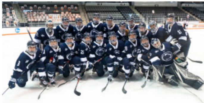
The 2020-21 Nittany Lions pose after their regular-season championship clinching win, 5-0, at RIT Friday, Feb. 19, 2021.

2019-20 Overall Record .....13-15-8 2019-20 CHA Record .....7-8-5 Postseason Finish..... CHA Semifinals Letterwinners Returning/Lost .....15/9 Newcomers.....9 Twitter.....@PennStateWHKY Instagram .....@PennStateWHKY Facebook.....PennStateWomensHockey