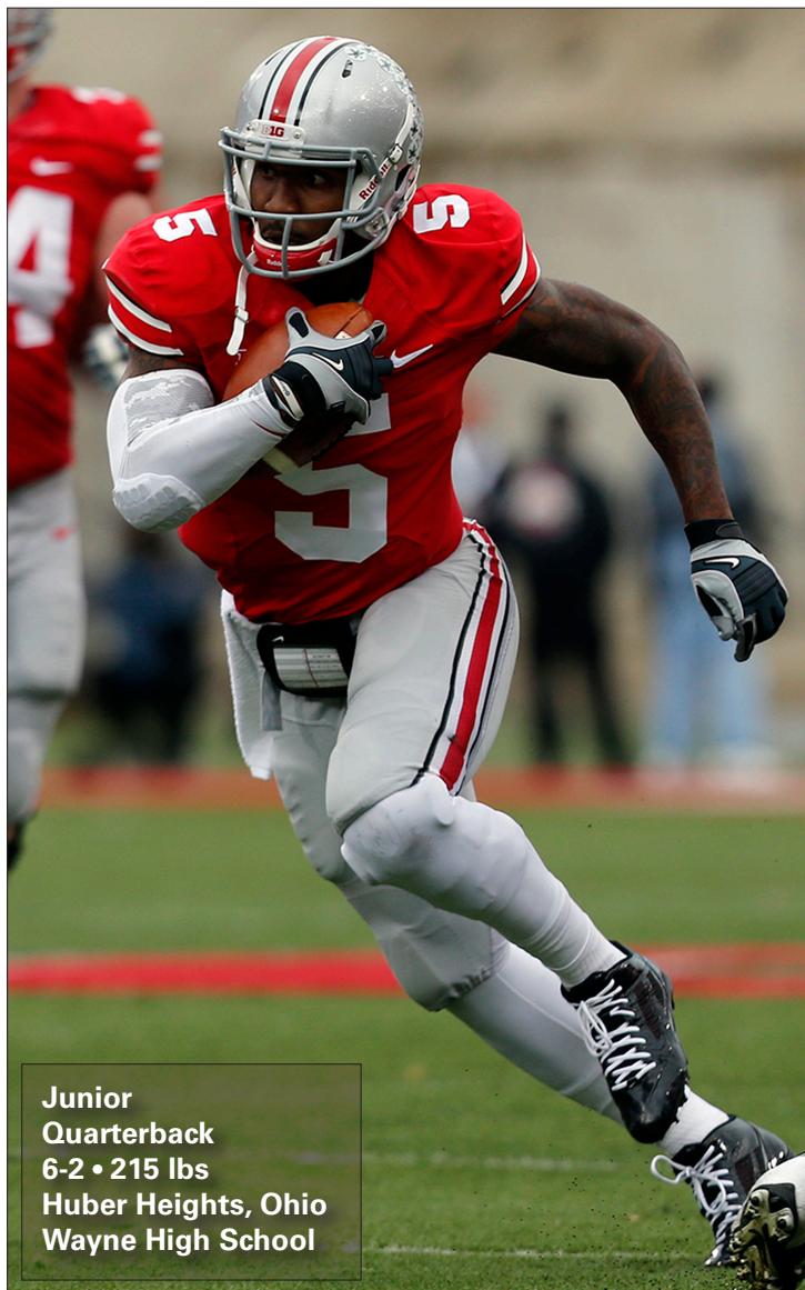
Junior Quarterback 6-2 • 215 lbs Huber Heights, Ohio Wayne High School