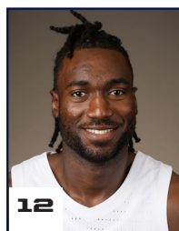
12 FAVOUR AIRE SO. | F | 6-11 | 220 EKPOMA, NIGERIA