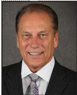
TOM IZZO HEAD COACH 29TH SEASON