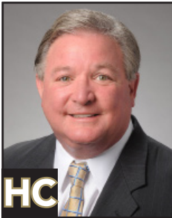
TERRY BOWDEN HEAD COACH

Third Season at Akron 21st Season Overall West Virginia '78