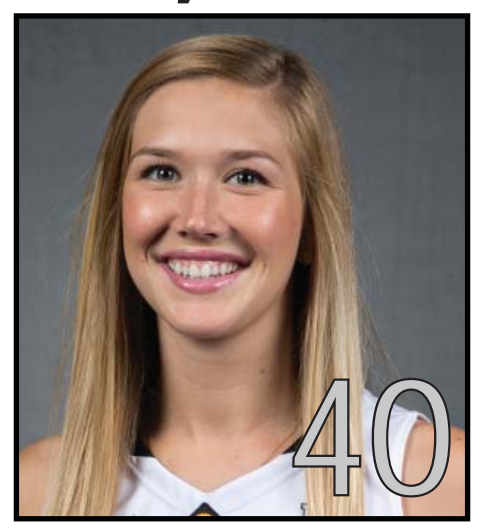
Forward • 6-2 • Senior Davenport, Iowa Assumption

2016-17... Has appeared in six contests this season... pulled down two rebounds in Iowa's win over Kent State... scored four points and recorded a steal in Iowa's win over UNI.