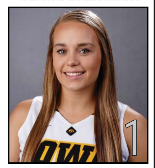
Guard • 5-10 • Senior Lincoln, Neb. Southeast

2016-17... Has appeared in all 15 contests this season... scored six points and dished out two assists in lowa's win over Kent State... recorded five points, three assists and three steals in lowa's win over UNI... scored a team-high 17 on 5-10 shooting from three-point range in lowa's win over UMass... registered two points, two assists, and two steals in lowa's win at North Dakota... went 2-for-4 from 3-point range in lowa's win love Hampton on Nov. 13.