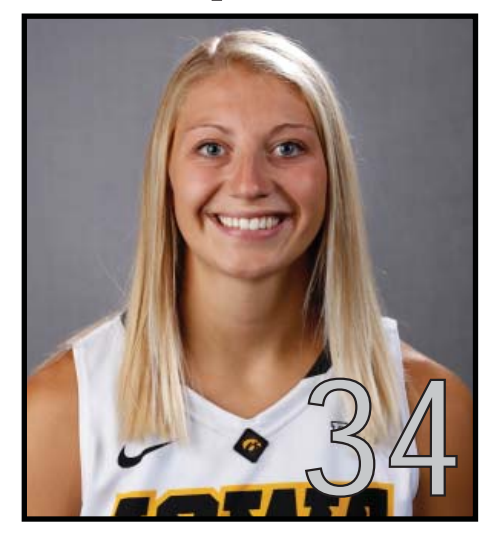
Forward • 6-1 • RS Sophomore Brodhead, Wis. Brodhead

2016-17... Made her first appreance of the season after battling back from injury in lowa's win over Kent State.