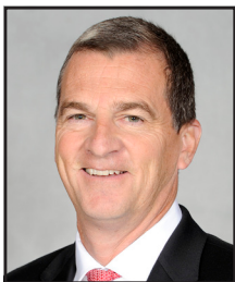
MARK TURGEON Head Coach 23rd Season Overall, 10th Season at Maryland Kansas, '87