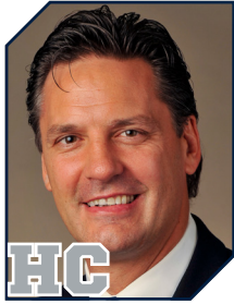
HC GUY GADOWSKY 12th Season Colorado College '89