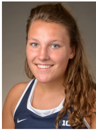
BES BOVELAND Freshman • F Overveen, Netherlands