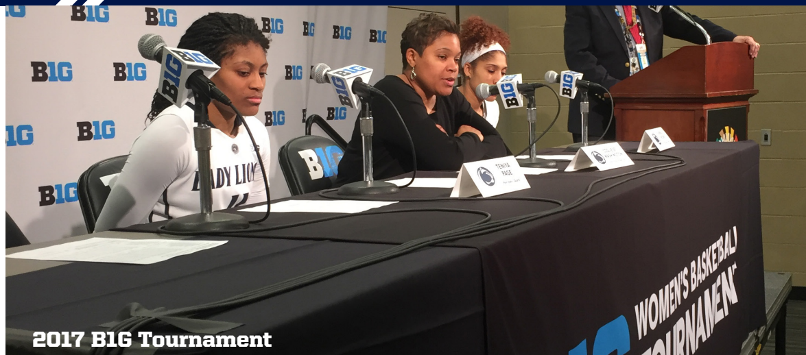
2017 BIG Ten Tournament