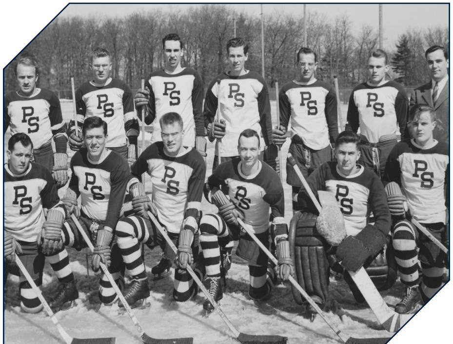
INAUGURAL VARSITY TEAM, 1940

It will be 25 years until organized hockey returns to Penn State.