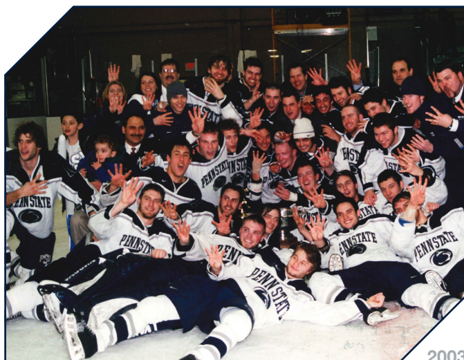
2003 ACHA CHAMPIONS