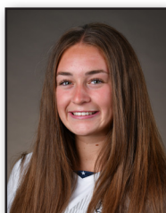
24 | Kennedy Ring FR | M East Greenbush, N.Y.