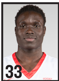
LATIO COSMOS 6-0 • G • FR