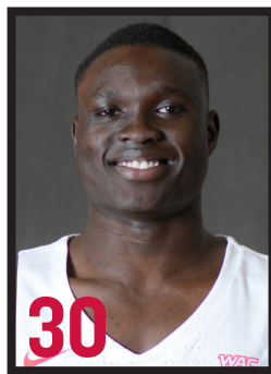
LATIO COSMOS 6-0 • 170 • G • SO