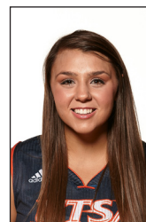
6-1 • C • Gr.

PPG - 6.0 RPG - 2.3 APG - 2.1 FG% - 30.7 3FG% - 30.3 FT% - 60.0