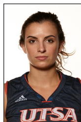
5-10 • G/F • Sr.

PPG - 4.8 RPG - 2.3 APG - 1.8 FG% - 38.1 3FG% - 100.0 FT% - 88.9