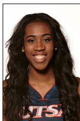
5-11 • G • So.