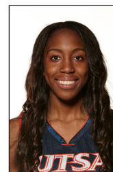
5-9 • F • Sr.

PPG - 2.4 RPG - 2.6 APG - 0.3 FG% - 38.8 3FG% - 0.0 FT% - 47.4