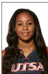
5-6 • G • Jr.

PPG - 8.6 RPG - 3.4 APG - 1.6 FG% - 44.9 3FG% - 9.1 FT% - 71.4