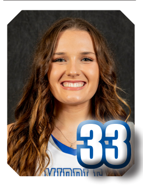
Forward • 6-0 • Jr. - 2L Kingsport, Tenn. Dobyns-Bennett HS