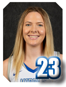
Guard • 5-11 • Sr.-3L Murfreesboro, Tenn. Riverdale HS