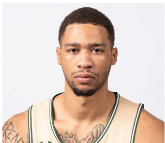
5 KJ BUFFEN