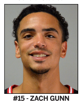
6-6 // Gr. // F Fishers, Ind. Organizational Leadership MS