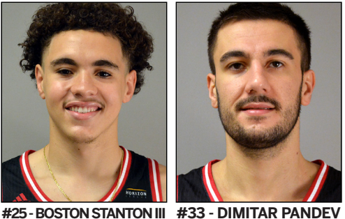
6-10 // Sr. // F Strumica, Macedonia General Studies