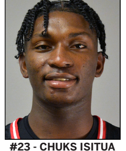
6-11 // Fr. // F/C Lagos, Nigeria OLS