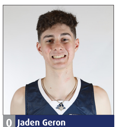
G • 6-8 • 175 • Fr. Fresno, Calif.

vs. Jarvis Christian (12/4/21) vs. Jarvis Christian (12/4/21)