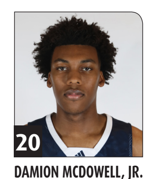
F • 6-6 • 190 • Fr. Inglewood, Calif. St. Bernard Catholic School