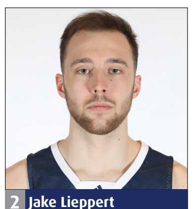
G • 6-4 • 200 • So. Scottsdale, Ariz. Saguaro HS • Pima CC