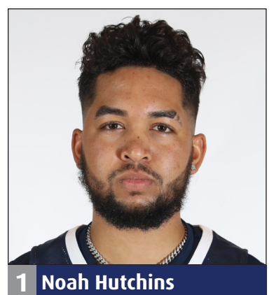
G • 6-1 • 195 • Fr. Buffalo, N.Y. IMG Academy (Fla.)