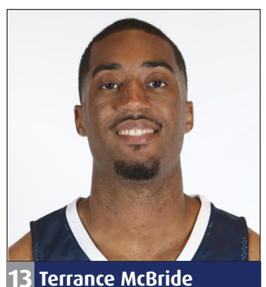
G • 6-2 • 170 • Gr. Lynwood, Calif. Sierra Canyon HS • Cornell