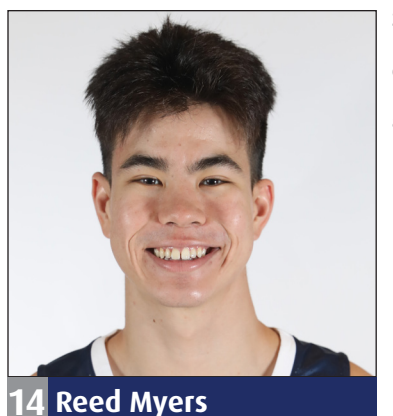
G • 6-0 • 180 • So. Phoenix, Ariz. Scottsdale Christian Academy