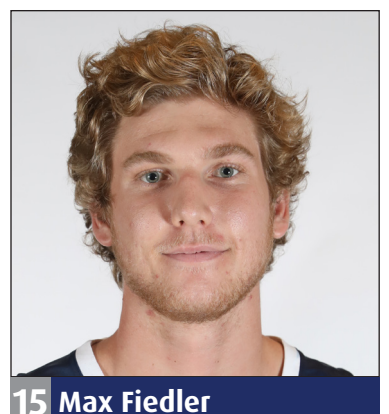
F • 6-11 • 235 • So. Indialantic, Fla. Melbourne HS