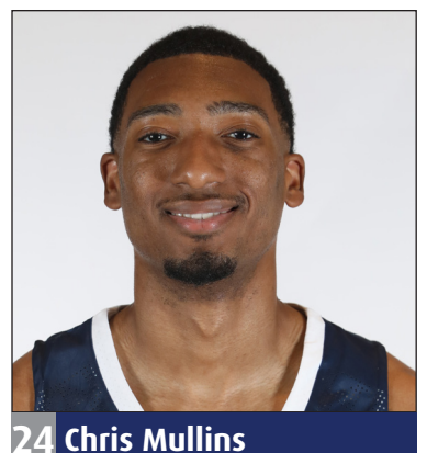
G • 6-3 • 190 • Jr. Grand Praire, Texas Mansfield Timberview HS

vs. Evansville (11/22/21) vs. Evansville (11/22/21)