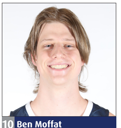
F • 6-8 • 225 • So. Wichita Falls, Texas Rider HS