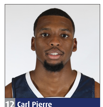
G • 6-4 • 190 • Gr. Boston, Mass. Boston College HS • Massachusetts