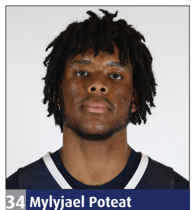
F • 6-9 • 260 • Fr. Reidsville, N.C.