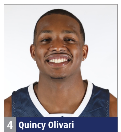
G • 6-3 • 200 • So. Atlanta, Ga. Westlake HS