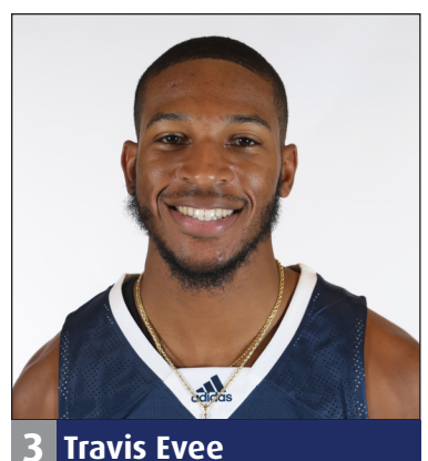
G • 6-1 • 180 • So. Randolph, Mass. Vermont Academy • VMI