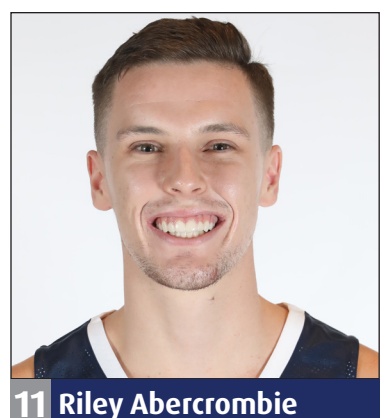
F • 6-10 • 210 • r-So. Wollongong, Australia Clear Lake HS (Texas) • Boise State