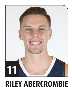
F • 6-10 • 210 • r-So. Wollongong, Australia Boise State