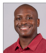
ASSISTANT COACH EARL BOYKINS