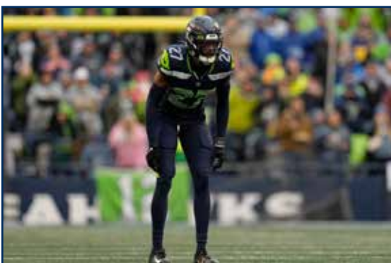
Tariq Woolen was selected by the Seattle Seahawks in the fifth round of the 2022 NFL Draft. The cornerback was named to the Pro Bowl after sharing the league lead in interceptions with six as a rookie.