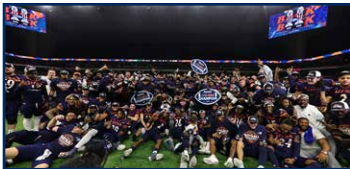
UTSA captured its second straight conference championship after defeating North Texas, 48-27, in the 2022 Conference USA Championship Game at the Alamodome.