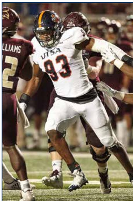
2017 Conference USA Defensive Player of the Year Marcus Davenport set UTSA career records with 38 tackles for loss, 22 sacks and 21 quarterback hurries.