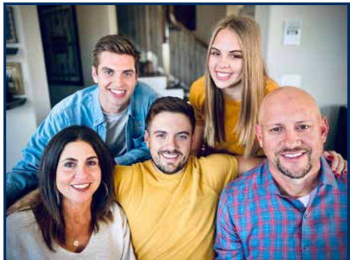
The Traylor Family