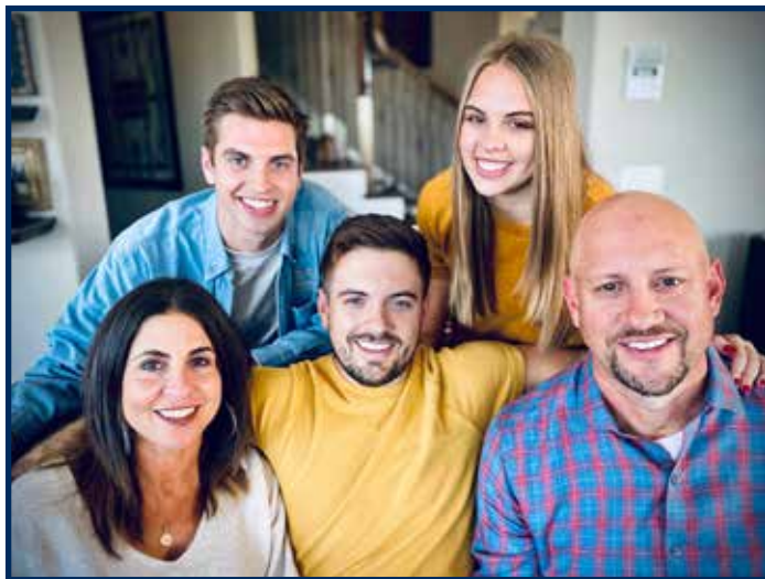
The Traylor Family