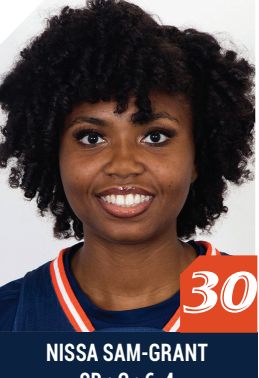
SR • C • 6-4 TORONTO, ONTARIO, CANADA