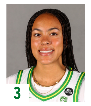
Fr. | Guard | 6-1 Portland, Ore.