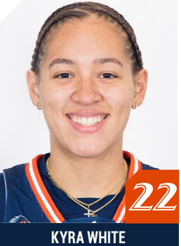
SR • G • 5-9 SAN ANTONIO, TEXAS