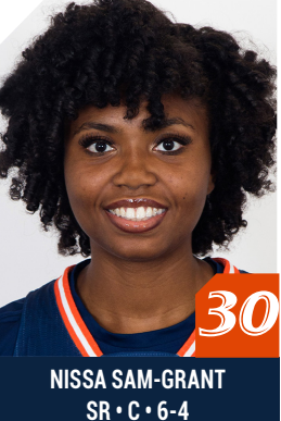
SR • C • 6-4 TORONTO, ONTARIO, CANADA