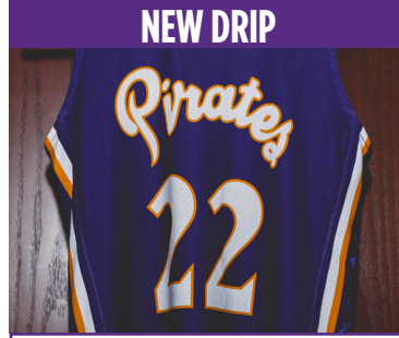
For the uniform supersititious, the Pirates will be rocking a new look when they take the court in purple or black this season as they got a uniform update for those colors in the offseason.