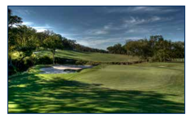
The 2024 NCAA Bryan Regional will be hosted by Texas A&M at Traditions Club.