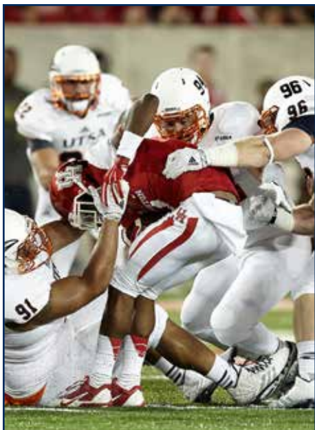
The Roadrunners defense held Houston to minus-26 rushing yards, the fewest allowed by UTSA in a game, in a 27-7 road victory in the 2014 season opener.