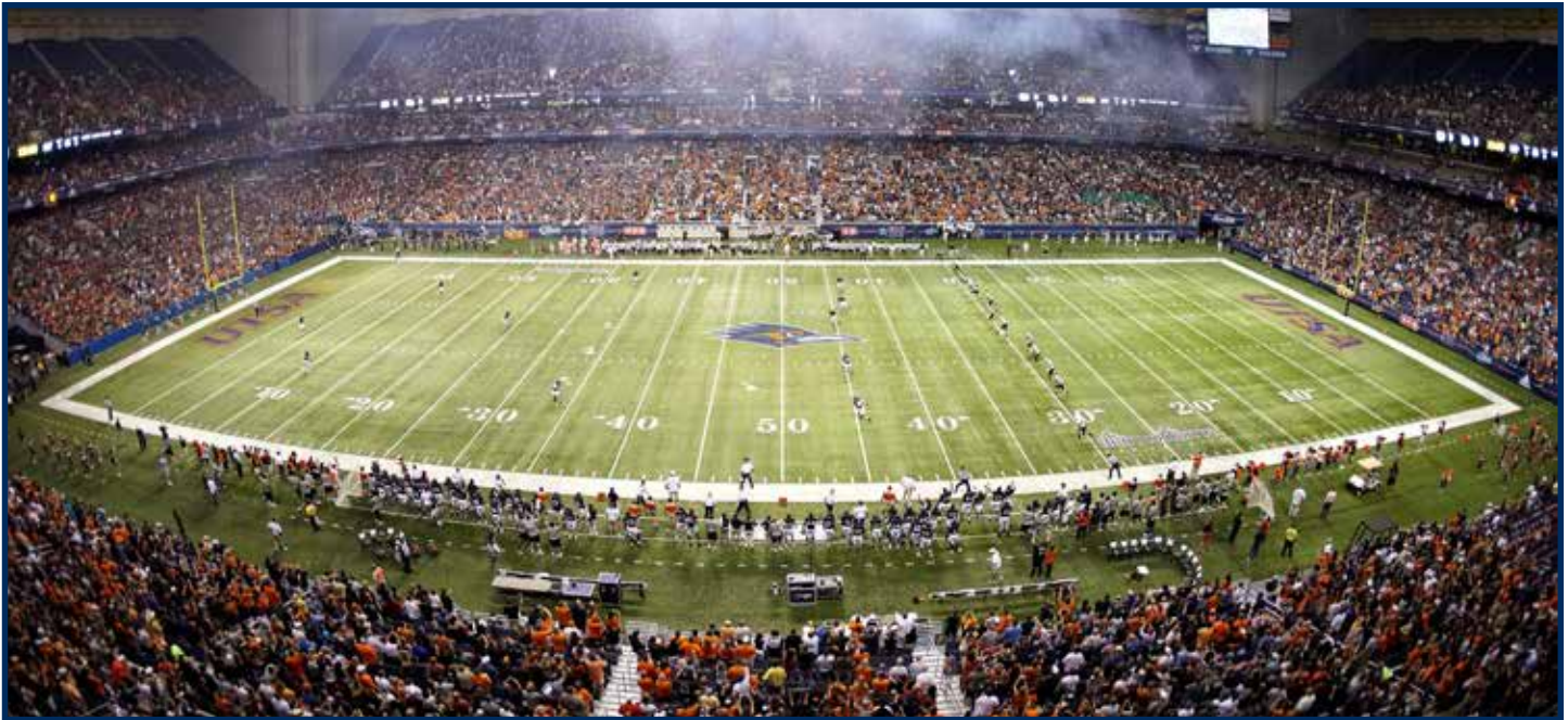
UTSA set an NCAA startup program record with 56,743 fans in the Alamodome for the Roadrunners' inaugural game against Northeastern State on Sept. 3, 2011.