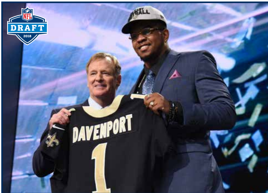
Marcus Davenport became UTSA's first-ever NFL first-round pick when he was selected 14th overall by the New Orleans Saints on April 26, 2018. The edge defender is entering his second season with the Minnesota Vikings in 2024.