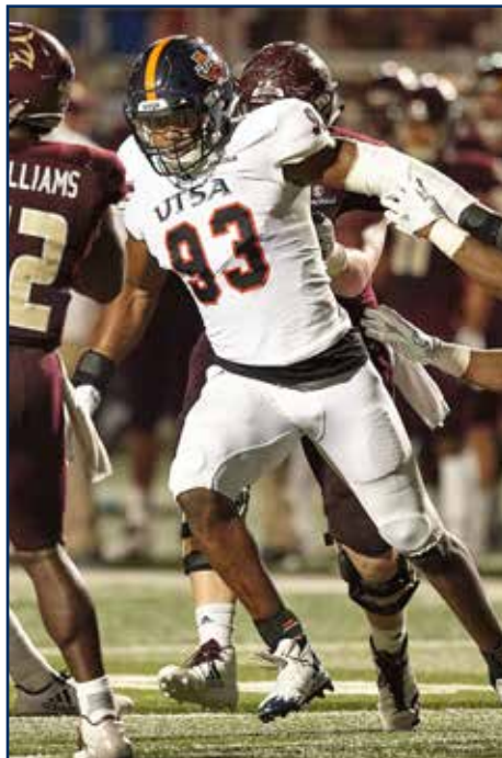
2017 Conference USA Defensive Player of the Year Marcus Davenport set UTSA career records with 38 tackles for loss, 22 sacks and 21 quarterback hurries.