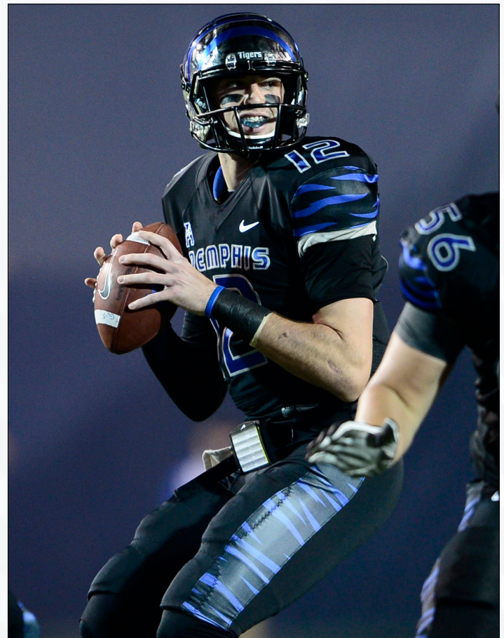
Paxton Lynch, Memphis