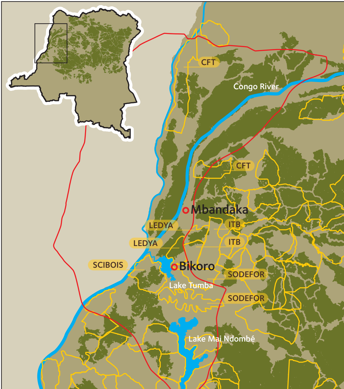
● Intact Forest Landscapes ● Logging Titles ● Lake T  l  -Lake Tumba Landscape