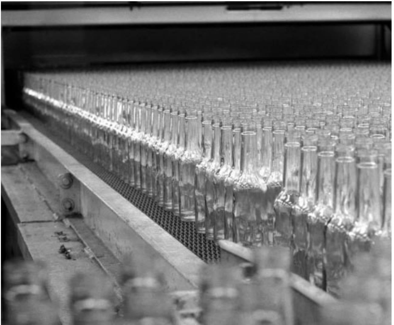
Glass bottles are ideal for re-use