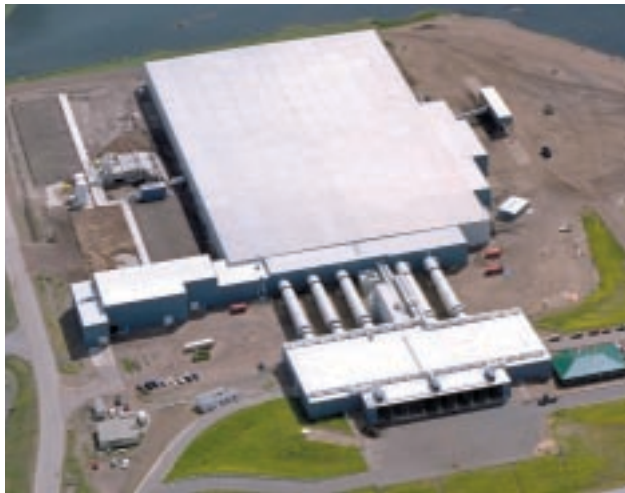
The MBT facility in Edmonton, Alberta