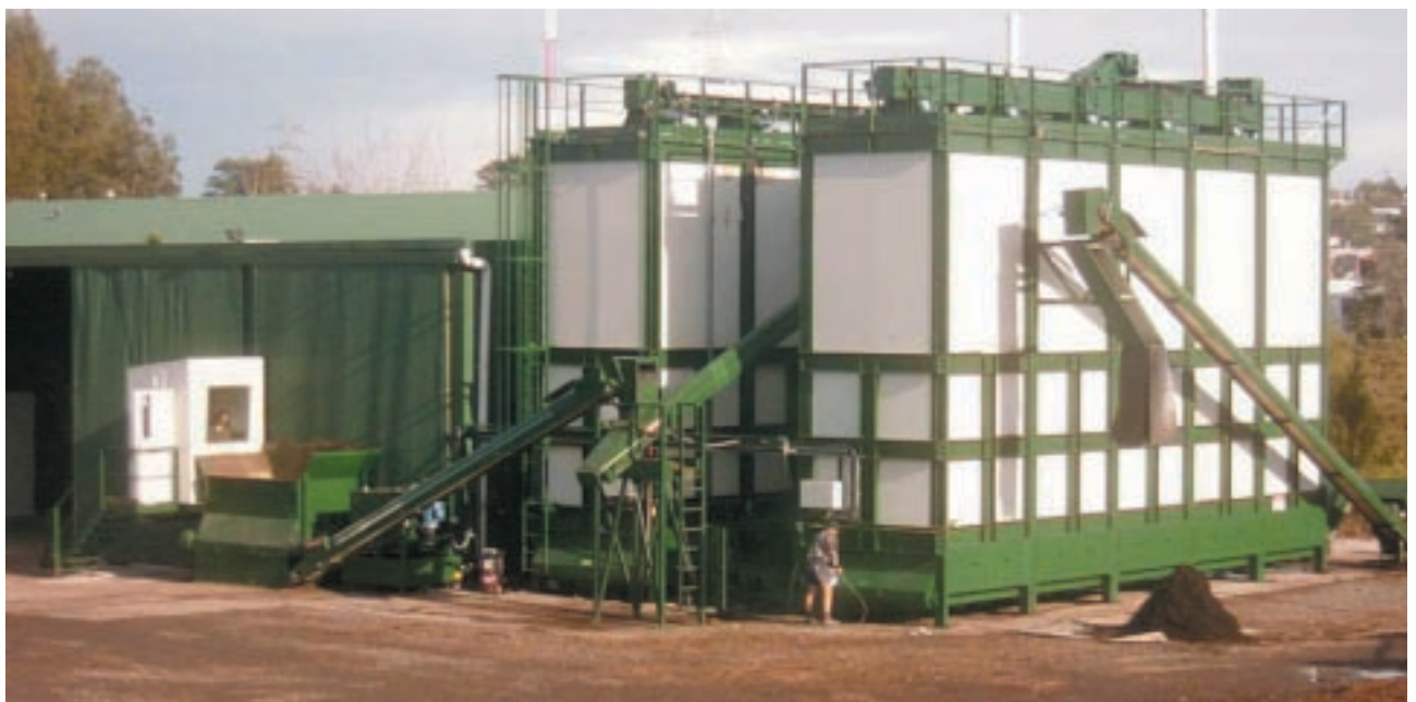
A Vertical Composting Unit. VCU sites in Australia and New Zealand process a wide range of organic materials – including green waste, food processing wastes, paper and sewage sludge.

In vessel composting systems allow greater control of the process and of its outputs. For dense, urban areas, a range of enclosed, in-vessel systems also ensure the absence of odours and cut transport and land costs. A high temperature can be obtained across the whole composting mass to ensure pathogenic organisms are killed. Composting is also quicker under these more controlled conditions. Operating costs tend to be higher than for windrow systems, but in terms of quality control, pathogen kill, land use and public acceptability, in-vessel systems will generally pay dividends. Some land, indoors or out, will normally also need to be set aside in which the compost can mature. Capital costs are typically between £3 million and £4 million per 20,000 tonne throughput.