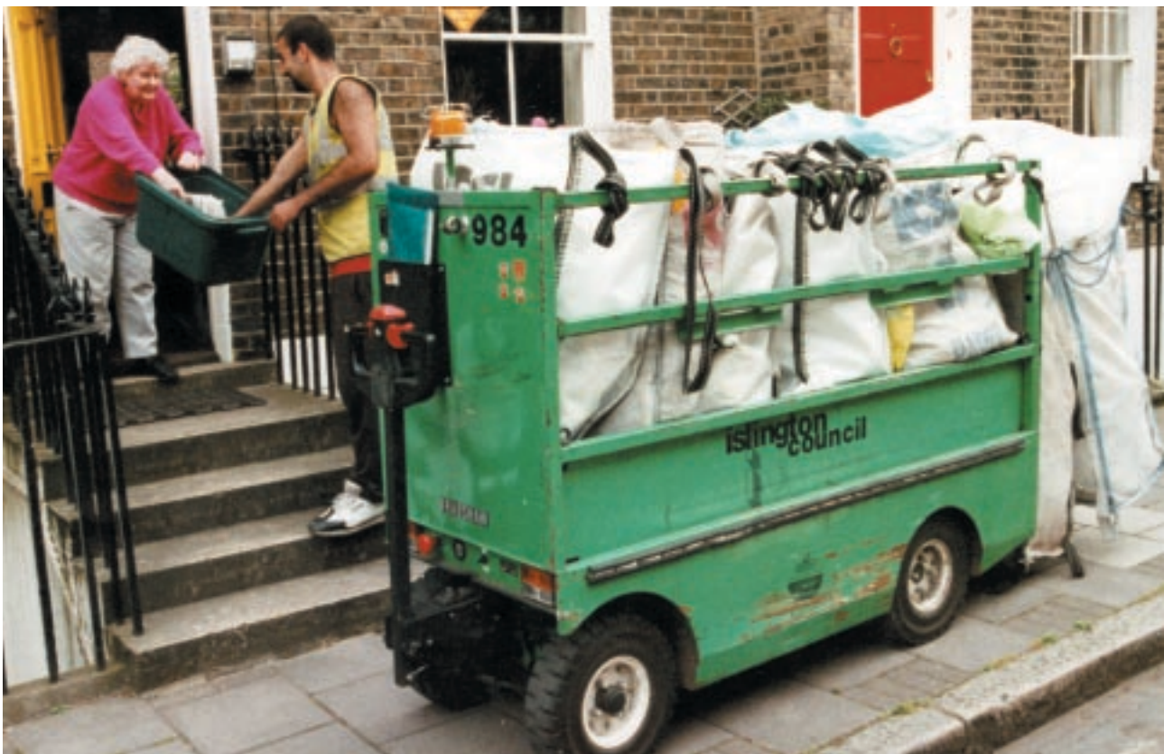
A PCV and operative at work in Islington

The materials collected are sorted into variously sized, labelled, builders bags on the platform of the PCV. The bags are rolled off into empty parking spaces or other collection points once full. The operative then unfolds a new set of bags and continues collecting, while a single, larger, crane equipped vehicle (@£35,000-£40,000) collects the sacks from 6 to 8 PCVs. The fact that one crane-vehicle driver can serve