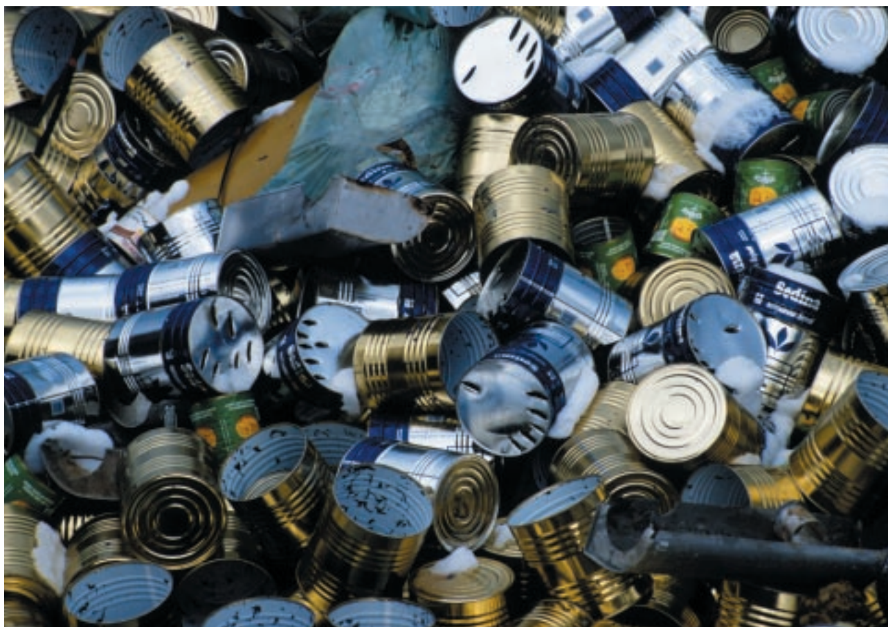
Resources currently discarded have been described as urban mines because of the untapped resources they represent.

The financial value of investing in education is easy to calculate. If a recycling system presently has 40% participation, and if those participants are separating out 40% of their recyclables – then just 16% of available recyclables will be set out for collection. It requires a solid educational campaign to increase those rates. If participation and separation rates are increased to just 60% and 60% (= 36%), this will more than double the materials set out. An 80% x 80% performance (=64%) will quadruple materials collected. It is a far better financial decision to spend 50p or £1 per household to get more materials set out in the first place, than it is to add another vehicle or piece of materials reclamation equipment.