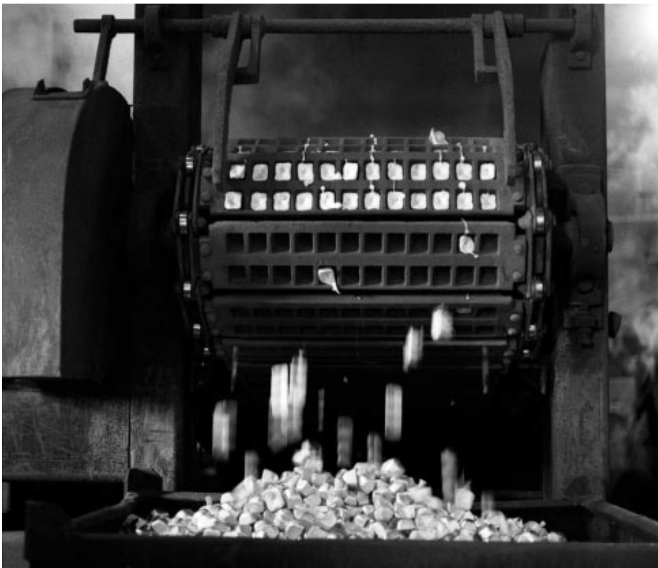
Aluminium moulding machine

There are many imaginative schemes in the UK and around the world in which waste reduction schemes play a significant part in waste strategies. Local authorities also have a considerable amount of buying power. Buying large quantities of refurbished and recycled products, particularly through supply-and-buy-back agreements can help stabilise markets for recyclates and recycled products.