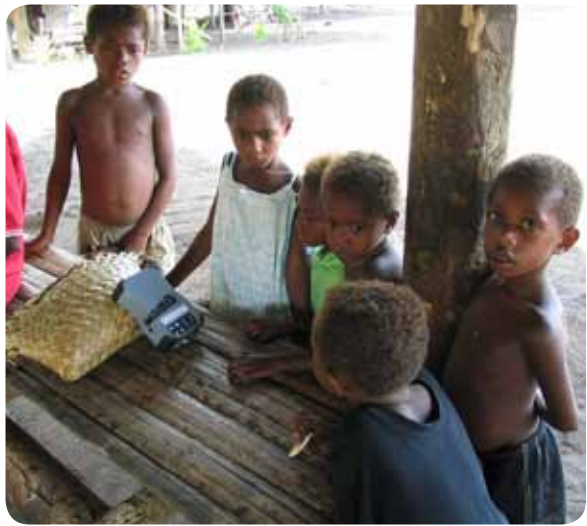
Bariai kids listening to a Saber