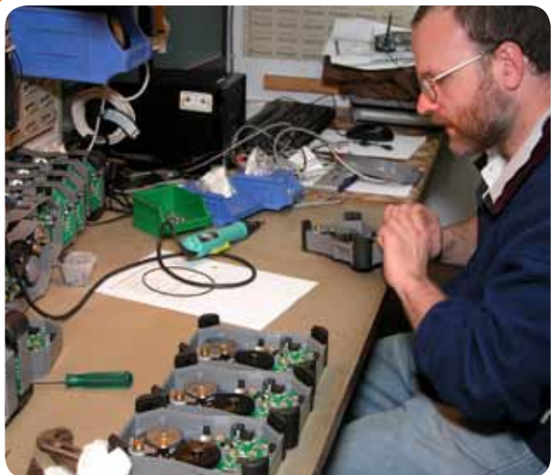
Saber assembly in Prospect

Please pray with us as we make this important, strategic and expensive decision.