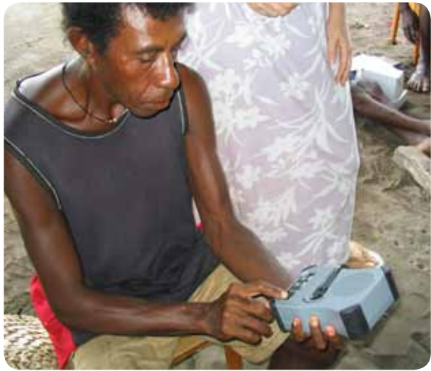
A Bariai man using a Saber