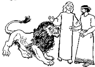
Book 5 On Trial for GOD

Based on the Sunday School Lessons published by the AIC Sunday School Committee, Juba, Southern Sudan.