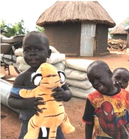
Children listen to GRN audio messages on Tumi the Tiger.

Displaced peoples are forced to leave their home countries because of war, unrest or other humanitarian crisis. Yousif, from Australia and James Shikuku, from Kenya met up in Uganda to explore the needs and opportunities to provide audio and visual materials to needy language groups that are displaced. They visited refugee camps in Uganda and found many language groups from South Sudan that need GRN materials.