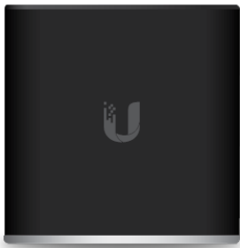
airCube ISP Access Point