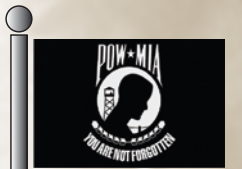
FLAG POLE (POW FLAG) - $15,000