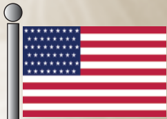
FLAG POLE (AMERICAN FLAG) - $25,000