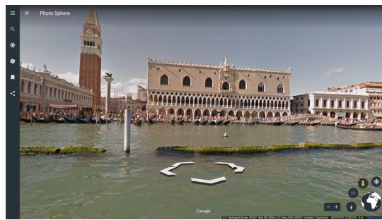
Hop on a boat and ride through the canals of Venice

Shibuya Crossing, Tokyo Louvre Museum, Paris Times Square, New York Rijksmuseum, Amsterdam Estádio do Maracanã Rio de Janeiro, Brazil Istanbul Toy Museum Buddhist Monks of Kemgon Gopa