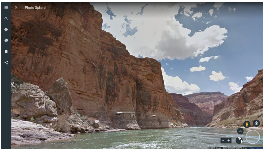
Raft down the Colorado River and the Grand Canyon

Lava Lake, Marum Crater, Ambrym Volcano Coastal Antarctica Iguazu Falls, Argentina Þingvellir National Park, Iceland Lofoten Archipelago, Norway Terrain of Mu Tian Chang Cheng