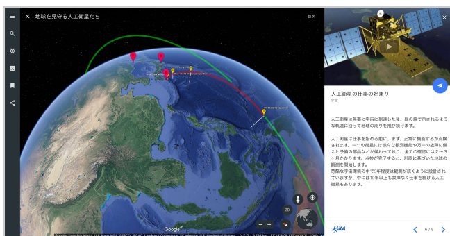
From “Riding a rocket: Beginning of a satellite mission”